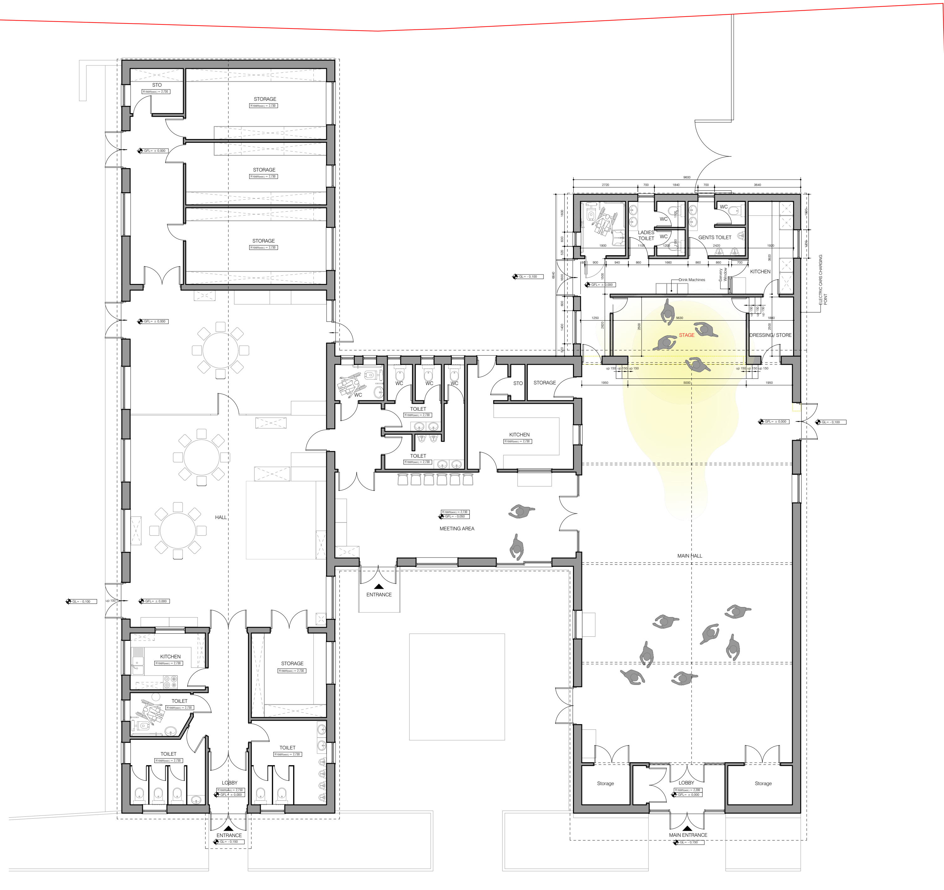
GROUND FLOOR PLAN AS PROPOSED SCALE - 1:100