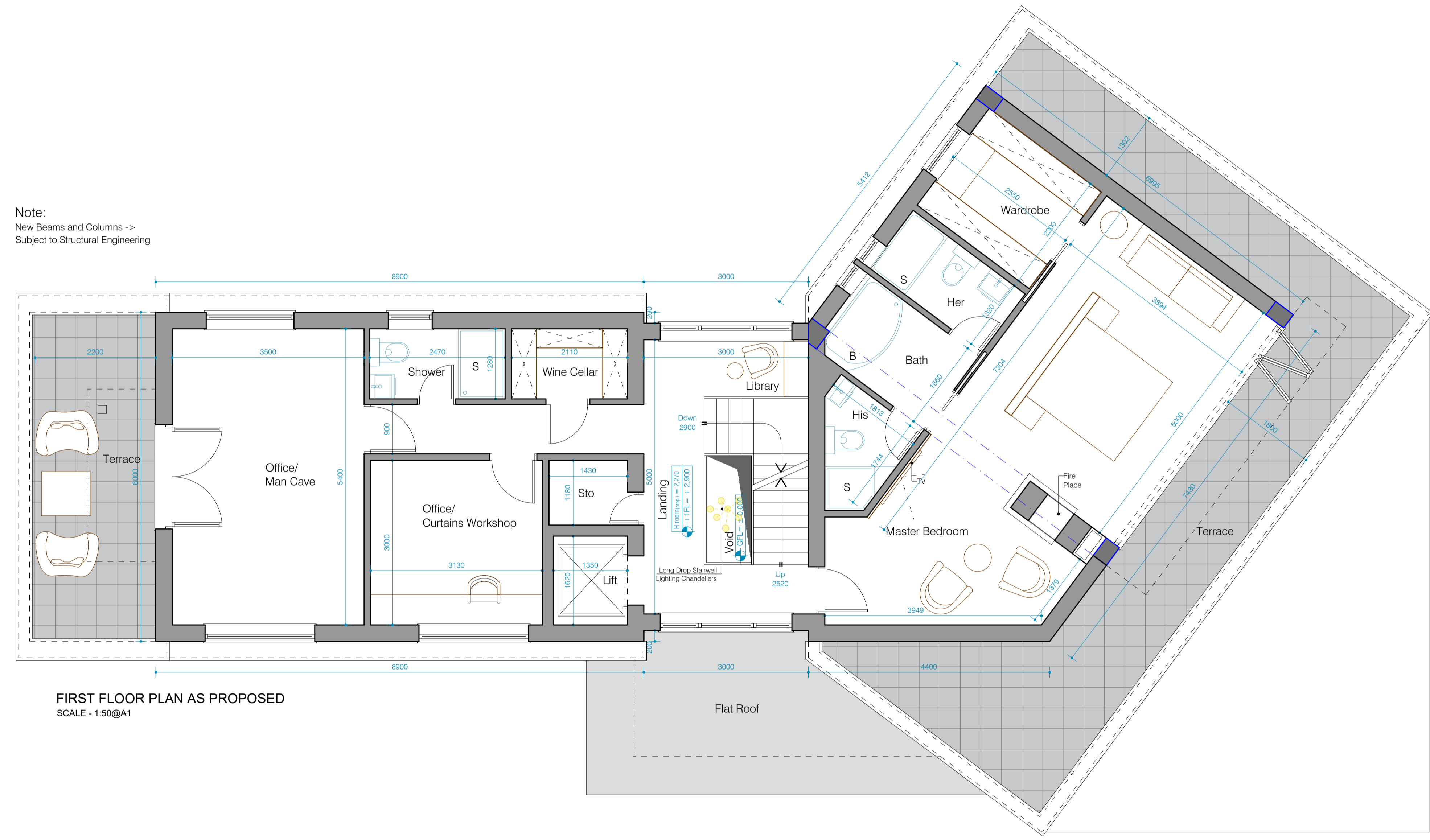
FIRST FLOOR PLAN AS PROPOSED SCALE - 1:50@A1

Note: New Beams and Columns -> Subject to Structural Engineering