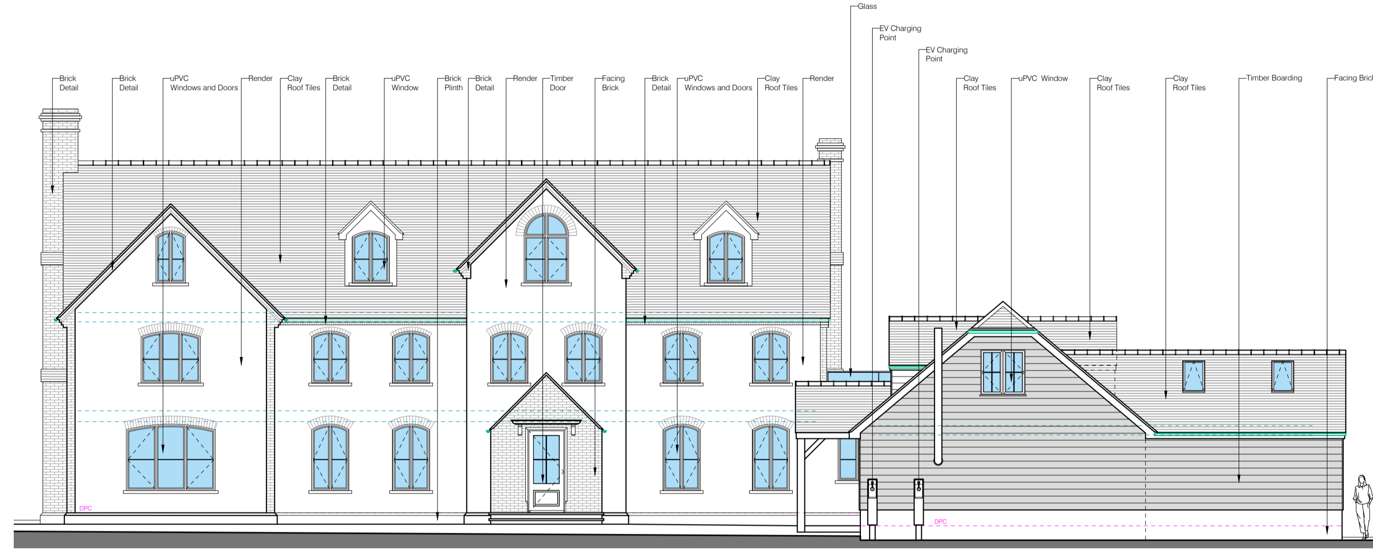
FRONT ELEVATION AS PROPOSED SCALE - 1:100@A1