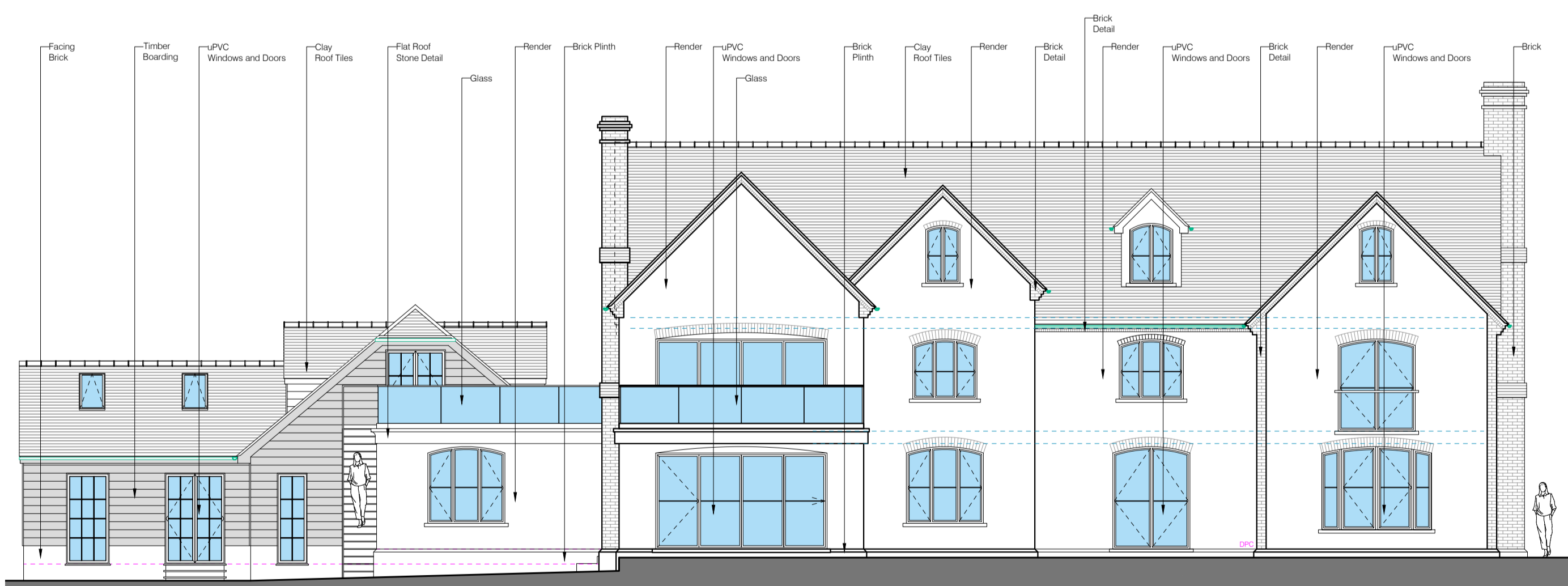
REAR ELEVATION AS PROPOSED SCALE - 1:100@A1