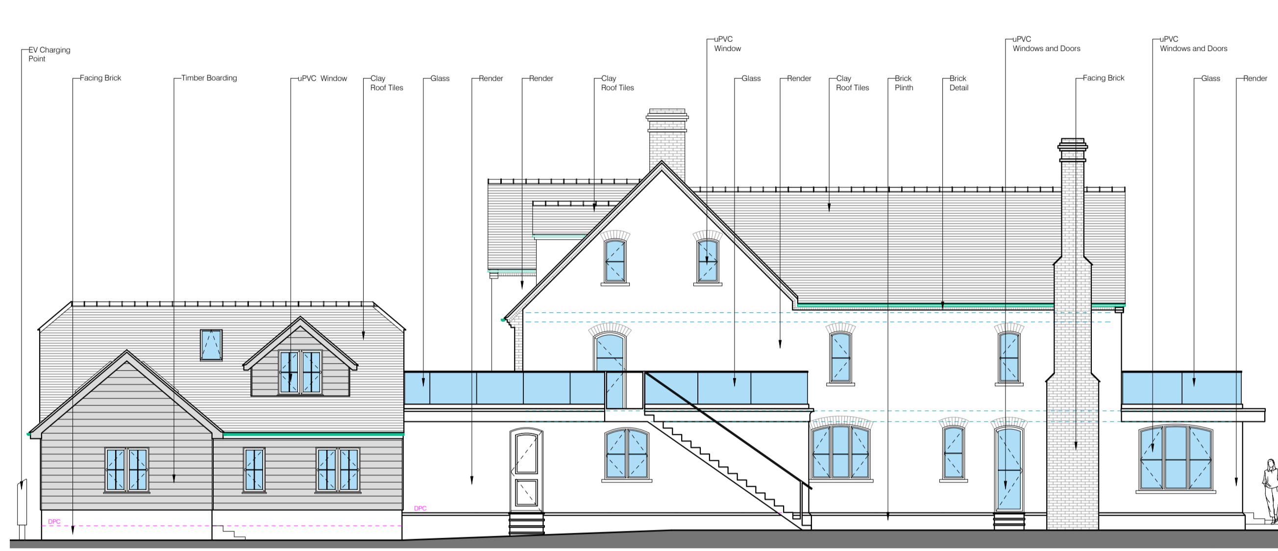
SIDE ELEVATION AS PROPOSED SCALE - 1:100@A1