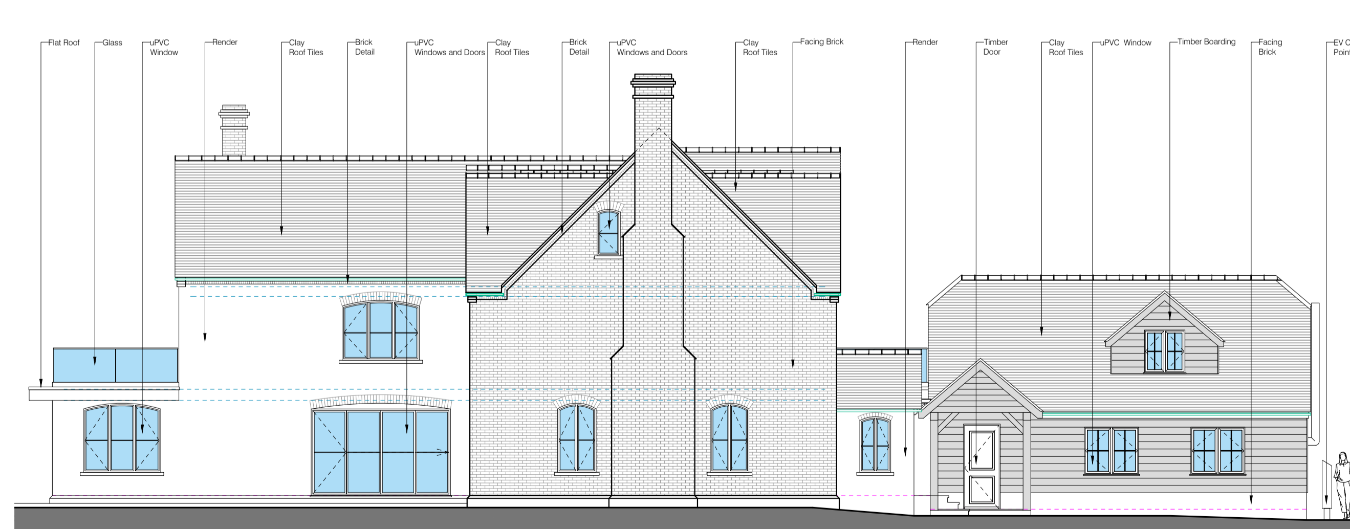
SIDE ELEVATION AS PROPOSED SCALE - 1:100@A1