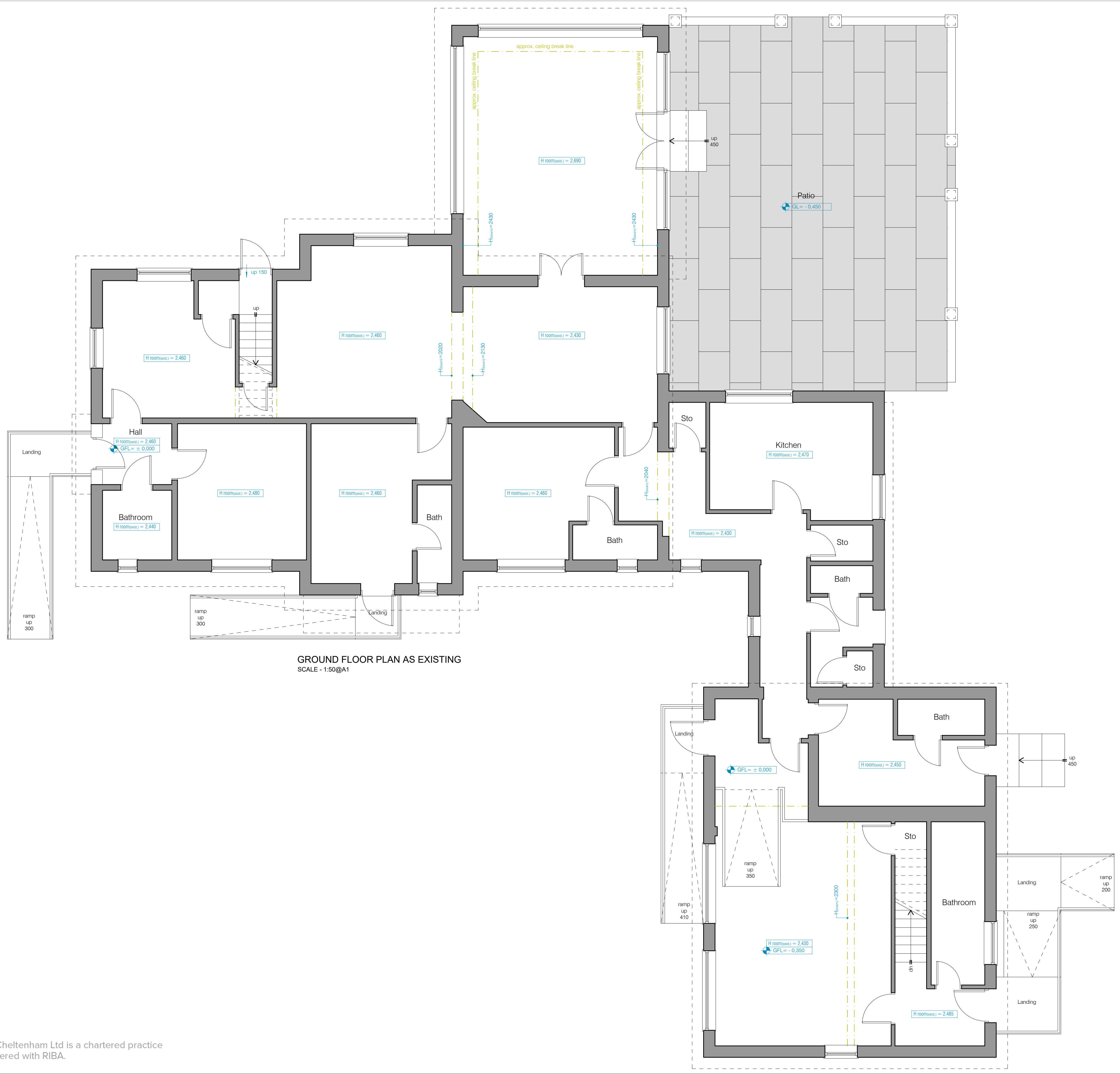
GROUND FLOOR PLAN AS EXISTING SCALE - 1:50@A1