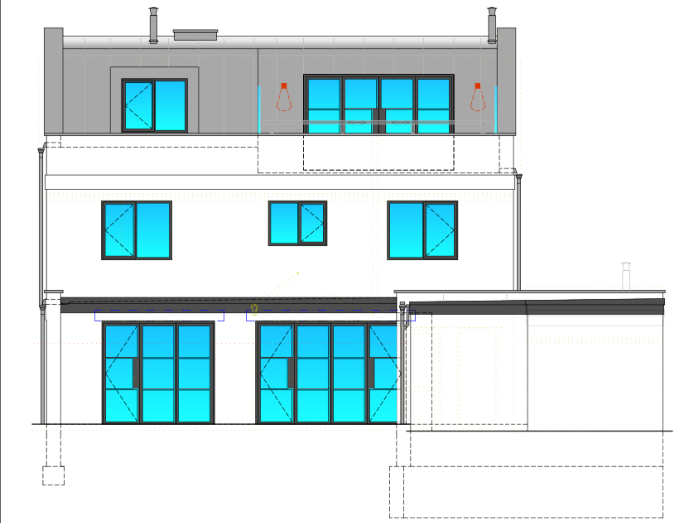
PROPOSED - SOUTH (REAR) ELEVATION 1:50