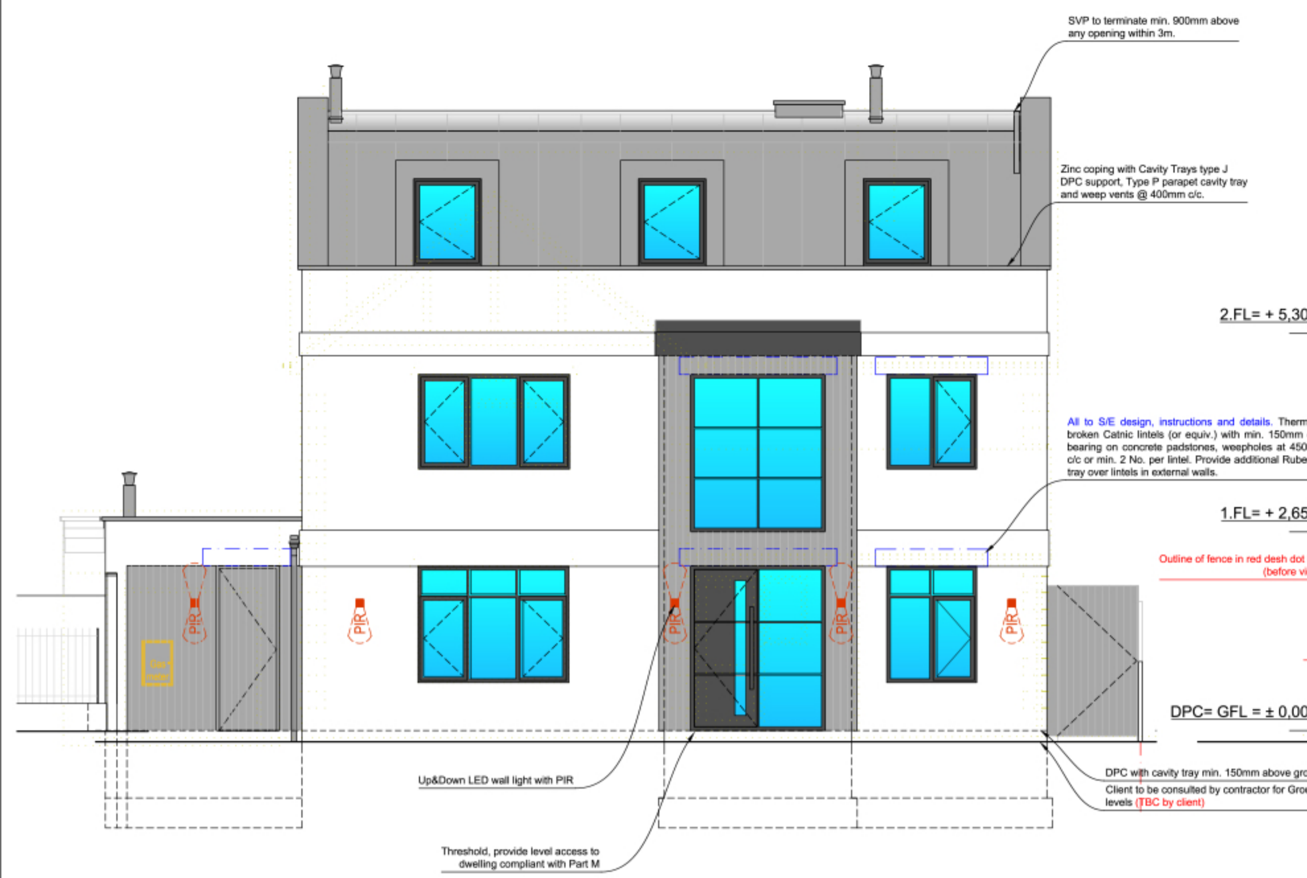
PROPOSED - NORTH (STREET) ELEVATION 1:50